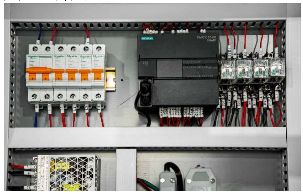
The PLC, which acts similarly to a microcomputer, controls the functionality and functioning of the packing machine. An HMI, which is often a color touch screen measuring between 7 and 12 inches, serves as the interface through which a person may make changes, get feedback, and obtain updates.

This is where the Human Machine Interface (HMI) and the Programmable Logic Controller (PLC) come into play (HMI).